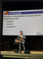
Dave Hatter, 2026

BSidesDayton is an independent, volunteer-run information security conference serving the Dayton region and greater Ohio infosec community. Since our first event in 2019, we have grown from a grassroots gathering into a full-day conference with a main talk track, hands-on villages, a capture-the-flag competition, and a vibrant after party.