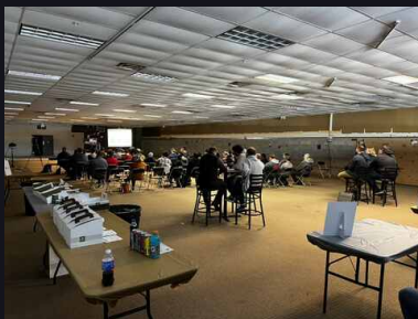
Main Track, 2022