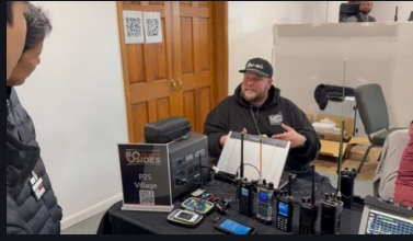
P25 Radio Village, 2026