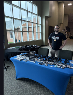
Badge Pickup, 2026