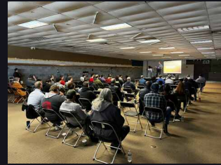
Conference Talk, 2022